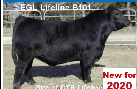
EGL Lifeline B101

Homo Black and Homo Polled. As royalty bred as you can get and numbers to match. Sired by the great calving sire bull Lifeline, maternal sire the "do everything right Sandhills" and behind that the "dam of elite herd bulls 802". 7756's dam is as elite a female as you can find and to see this bull he is as impressive as you can find for quality. Early progeny reports indicate he will be a heifer bull and still sire the right kind that grow. 7756's EPD's are elite with CED (30%), WW (10%), YW (15%), HP (3%) and DOC (15%). Use this bull for calving ease with growth but better yet he will sire market topping cattle whatever avenue you choose to market. CE, impressive growth & phenotype.