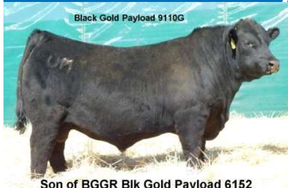
Son of BGGR Blk Gold Payload 6152

AMGV 1367868 Semen: $40 Birth: 12/12/2015